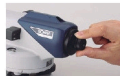
40x Eyepiece EL5 (B20)