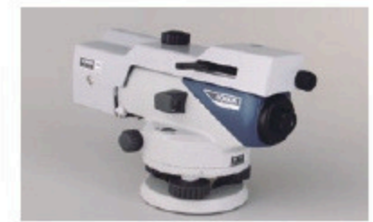
Optical Micrometer OM5 (B20)