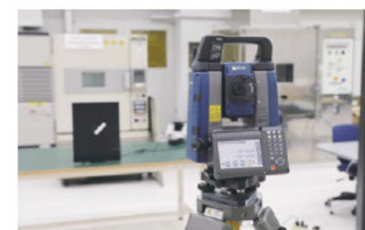
Auto-tracking durability test against rotating object.