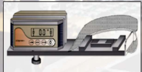
Application of Gradient Spirit Levels

Paragon Instrumentation Engineers Pvt. Ltd.